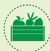
Harvesting & Storage