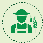
FPOs, Cooperatives, SHGs