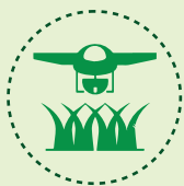
Technology & Innovation in Agriculture