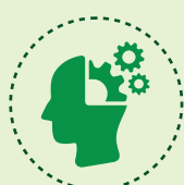
Skilling, Agri Tourism & F&B Industry Opportunities