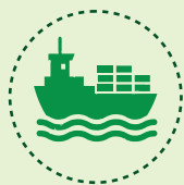
Marine & Export