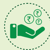
Financing & Credit Linkages