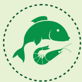
Fisheries, Animal Husbandry & Dairying